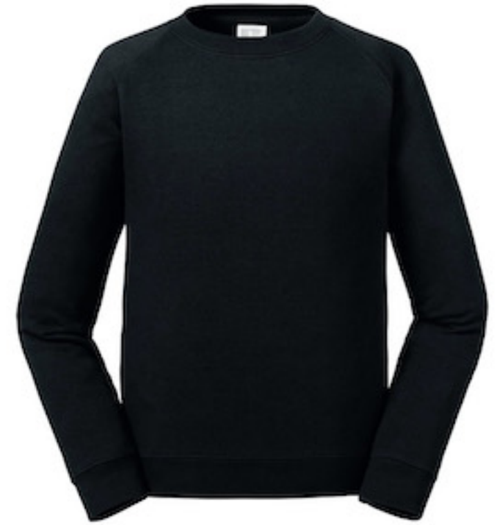
271B Children's Authentic Raglan Sweat SIZE 3-14 Years

MATERIAL: 80% Combed Ringspun Cotton; 20% Polyester; Outer fabric 100% Cotton (3 layer fabric)