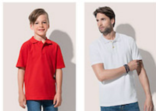
ST3200 Polo Kids ST3000 Polo